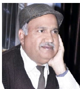
By: Vijay GarG

Climate change affects the social and environmental determinants of health – clean air, safe drinking water, sufficient food and secure shelter.